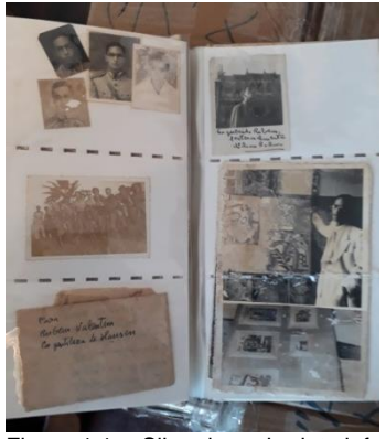
Figure 1.1 – Silver based prints infected by fungi with areas of emulsion loss.

The material, following the safety protocols, was submitted to the IPEN pre-calculated doses for each support material and received absorbed doses from 8 kGy to 10 kGy. What we got from the results were fungal and bacterial-free documents, safe to handle and ready to be mechanically sanitized and archivally treated, as we can see in the Figures 2.1, 2.2, 3, 4.1 e 4.2.