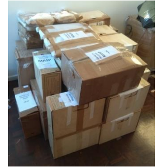
Figure1.6 - Boxes separated by support type, ready to be taken to IPEN.