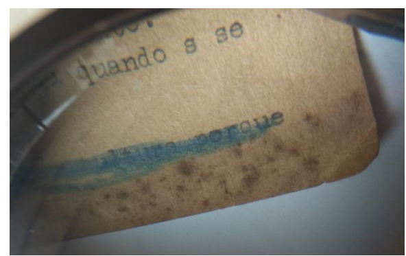
Figure 4.1 - Paper infected by fungi.