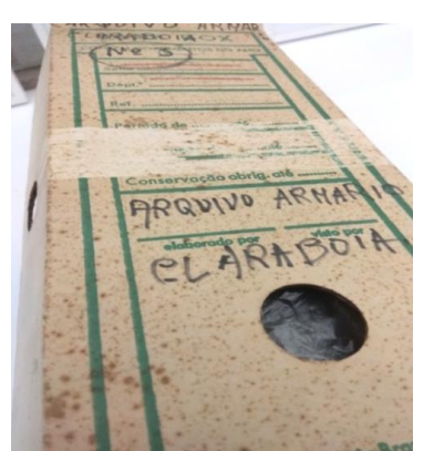
Figure1.2 – Detailof the rusty boxes with the inscription "Clarabóia".