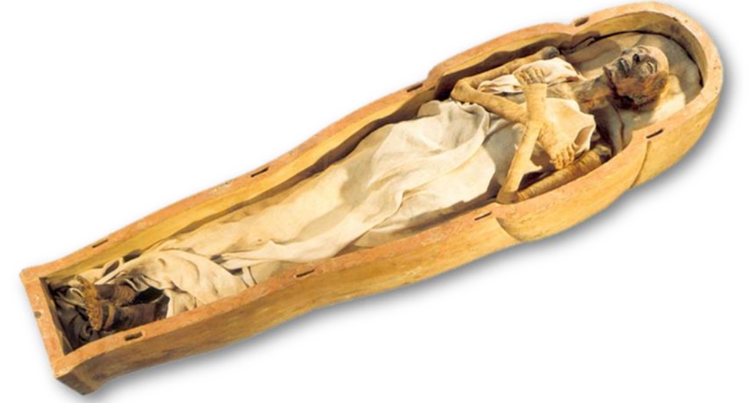
The mommy of Ramses the second was treated in 1977 by gamma radiation to arrest fungi contamination.

In ARC-Nucléart, many thousands of cubic meters have been treated since the seventies, mainly for insect eradication. It included furniture, wooden sculpture, ethnographic artefacts, musical instruments, taxidermy specimen, modern art, etc. Mummies, among which the one of Ramses the second, have been also treated. A frozen baby mammoth is another illustration of what can be treated by this method (gamma irradiation does not lead to any thermal effect).