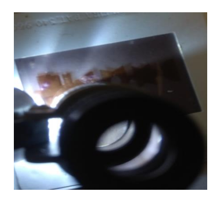
Figure 2.1 - Colored diapositive infected by fungi on the emulsion part.