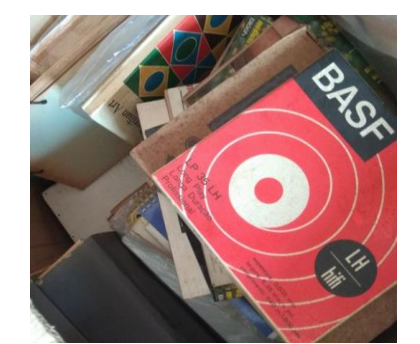
Figure1.5 – Various genres and types of media.