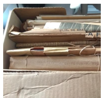
Figure1.4 - Weak and brittle newspaper.