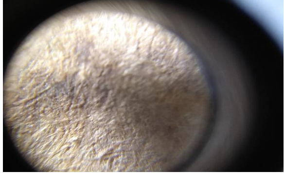
Figure 4.2 - Detail of infected area after gamma radiation, bringing only stains to paper fibers (60X).

Thus, we conclude that the gamma-ray disinfection method proved to be adequate for our needs of receiving and incorporating the documentation into the MASP Research Center collection, as well as giving us the security of not affecting the physical characteristics of the documents beyond your natural aging process.