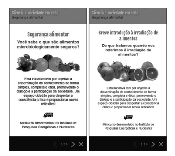
Fig. 4 Responsive web design for mobile devices

The project involves the creation of computerized models that comprise the various aspects of food irradiation in daily life, as described below.