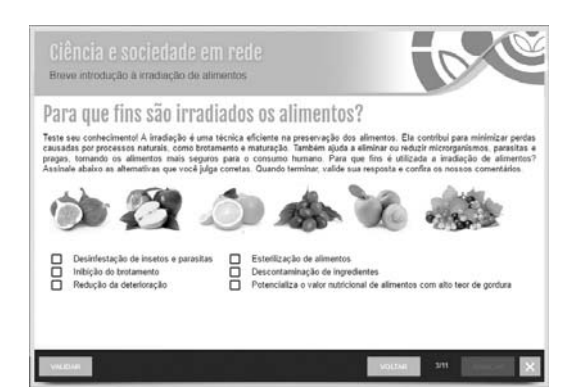
Fig. 3 Interactive exercises to check public's previous knowledge