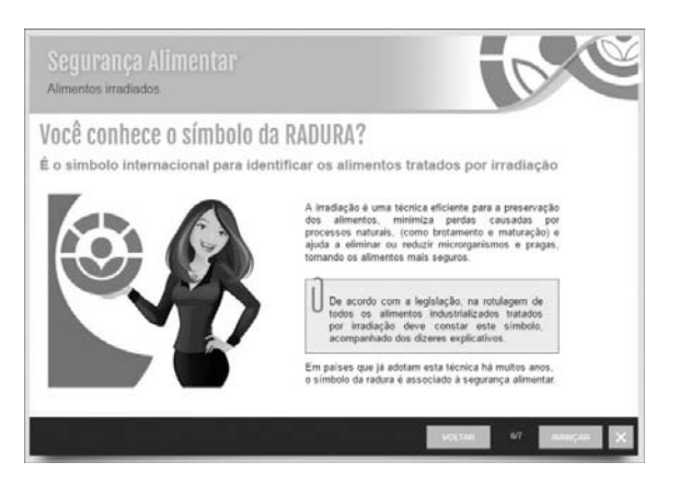
Fig. 2 Informing the general public: concepts about food irradiation

visitor. According to the equipment and resolution of the screens, the layout automatically adjusts for best viewing and better use of educational resources designed for the transmission of each content, as seen in Fig. 4.