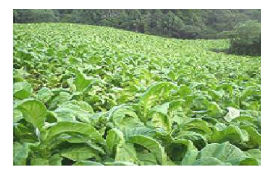
Figure 2. Tobacco Plantation