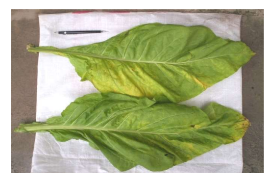
Figure 1. Leaf of Nicotiana tabacum L.

Brazil (Figure 2), comprising three states, Rio Grande do Sul, Santa Catarina and Paraná [8], [9]. The cultivation of tobacco is one of the main agricultural activities in Rio Grande do Sul, the state with the largest planted area (180,000 ha), where Virginia and Burley types are grown, accounting for 78.2% and 20.5% of the area, respectively, with the remainder being common tobacco [10], [11]. ]. Figures 1 and 2 present photographs taken during this work.