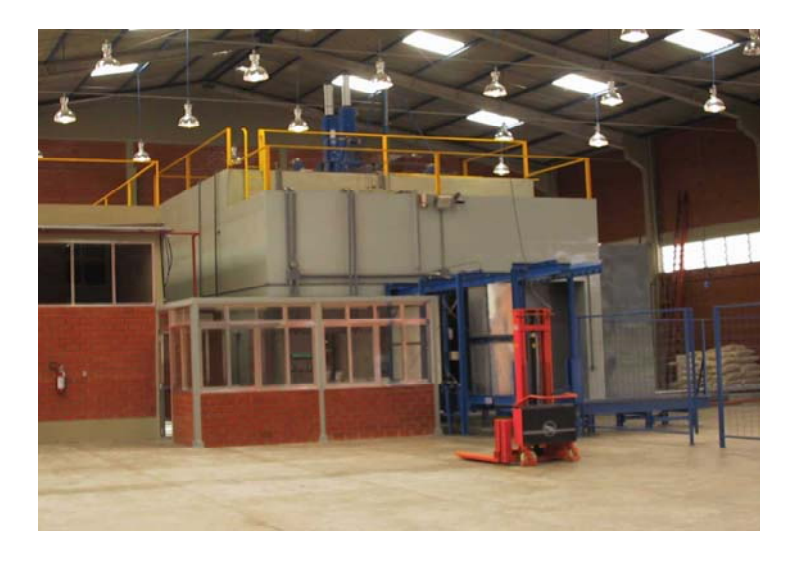
Fig. 1. Multi application gamma irradiator – IPEN - Brazil

validation, training and qualification of operators and radioprotection officers. The Figure 1 shows the compact gamma irradiator set up at IPEN.