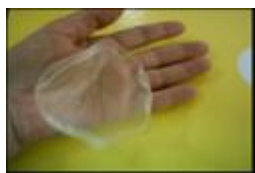
Figure 4 – Swelled hydrogel from PVA \ell / PEG