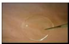
Figure 1 – Dried PVA \ell hydrogel