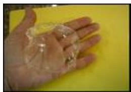
Figure 3 – Dried hydrogel from PVA \ell / PEG