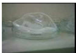
Figure 2 – Swelled PVA \ell Hydrogel