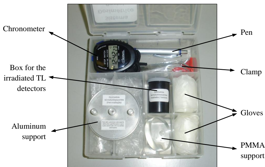
Figure 1 – Items of the dosimetric postal kit, for the calibration of ^{90}\text{Sr}+^{90}\text{Y} clinical applicators.

A ^{90}\text{Sr}+^{90}\text{Y} clinical applicator was utilized as a secondary standard system for the calibration of the other applicators, because it was calibrated at the primary standard laboratory National Institute of Standards and Technology (NIST). This applicator was called, in this work, NIST applicator. During the irradiations, the distance between each sample and source was null (in the same conditions used during the irradiations of the NIST applicator), and an adequate support to fix the source (vertically) on the pellet was utilized.