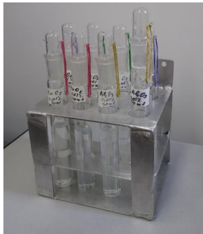
Figure 1. Nanofluid samples prepared for irradiation.

Nanofluid samples of ZrO_2 were irradiated in a Co-60 source at IPEN Multipurpose Irradiator. Samples were prepared and arranged in 50 ml borosilicate tubes and irradiated at a different time depending on the desired dose. Gamma radiation doses studied was 1 MGy and 2 MGy.