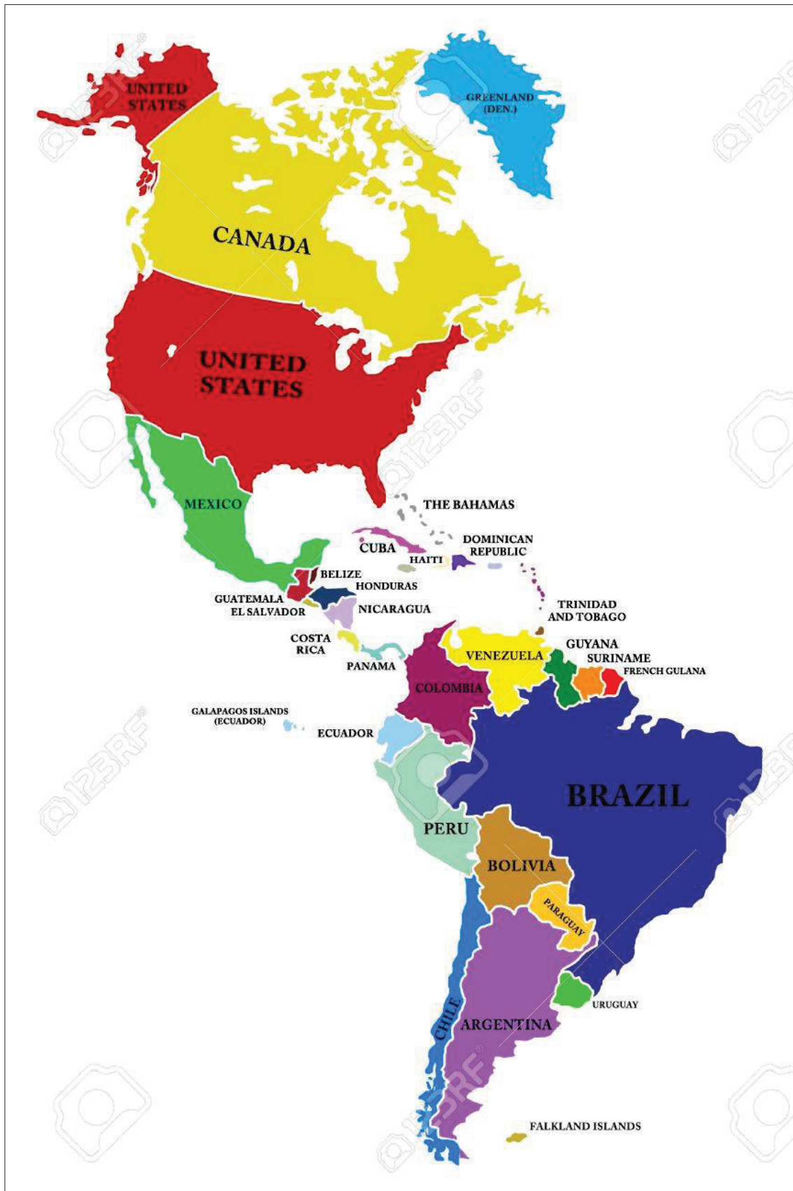
Figure 2: Analytical Laboratories for the Measurement of Environmental Radioactivity membership in the North and Latin America Region. North America 4: Canada 2, Mexico 2. Central America 1: Costa Rica. Caribbean 3: Cuba 2, Jamaica 1. South America 8: Brazil 3, Peru, Argentina, Chile, Uruguay, Venezuela