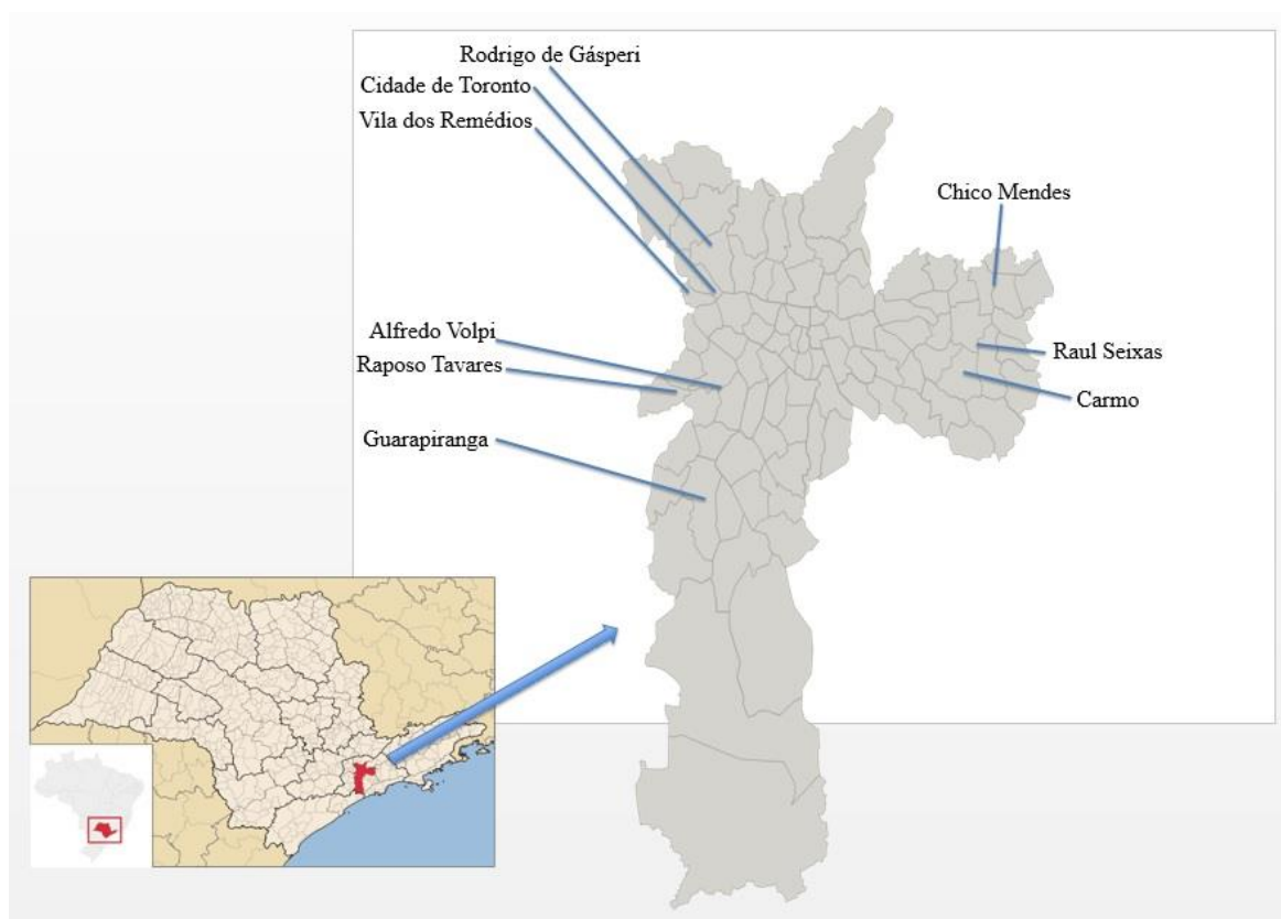
Figure 1: Localization of the studied parks in São Paulo city

According to CETESB, the Environmental Protection Agency of the State of São Paulo, the RMSP suffers from all kinds of environmental problems. The main contributions to atmospheric emissions come from about 2,000 highly polluting industries and an ever increasing 7 million vehicle fleet [17]. Nine public parks of São Paulo, covering different regions of the city, were studied (Fig. 1).