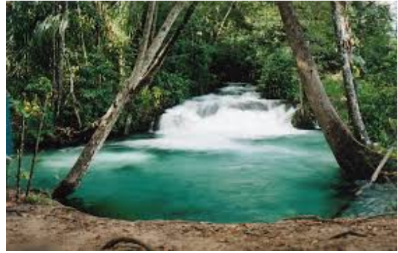
Fig. 4 Formiga Waterfall

The site has natural tourist attractions that propitiate the practice of ecotourism: dunes, waterfalls, mountains and ecological trails (see Figs. 1-4). The attractions have been exploited in a disorganized manner, as the efforts towards touristic planning have shown to be ineffective.