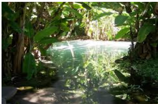
Fig. 3 Fervedouro das Bananeiras