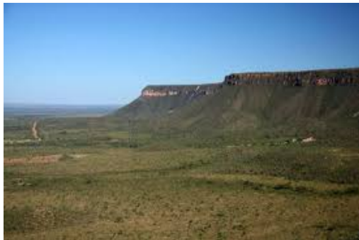
Fig. 2 Serra do Espírito Santo