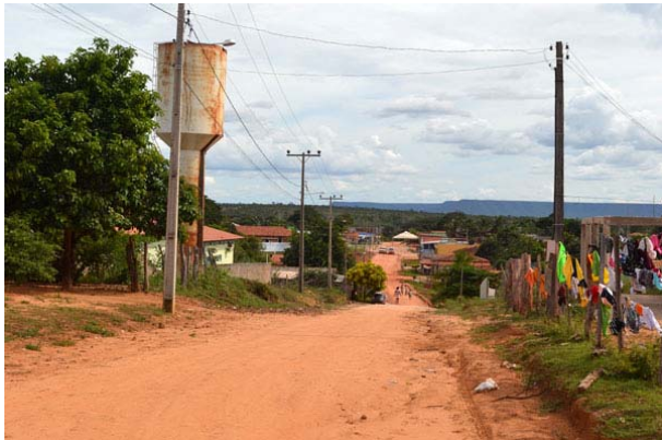
Fig. 7 Streets of Mateiros

referred to the water supply, public cleaning services, public security, banking services and tourism signage.