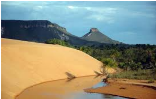
Fig. 1 The Dunes

Among the towns that make up the Jalapão, Mateiros (9,681,657 km 2 ; 2,223 inhabitants) is one that profits most from the tourism flow in the region [3]. It is in a privileged location in relation to the others. It is also the town that is nearest to the park attractions; thus, it is the main center for receiving tourists and where tourists tend to stay longer during the seasons.