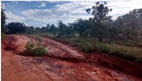
Fig. 8 Access road to the city of Mateiros

As for the water supply, respondents reported that there is a constant lack of available water in Mateiros; a problem is exacerbated during the tourism season, when the demand for water by stakeholders in the tourism sector increases.