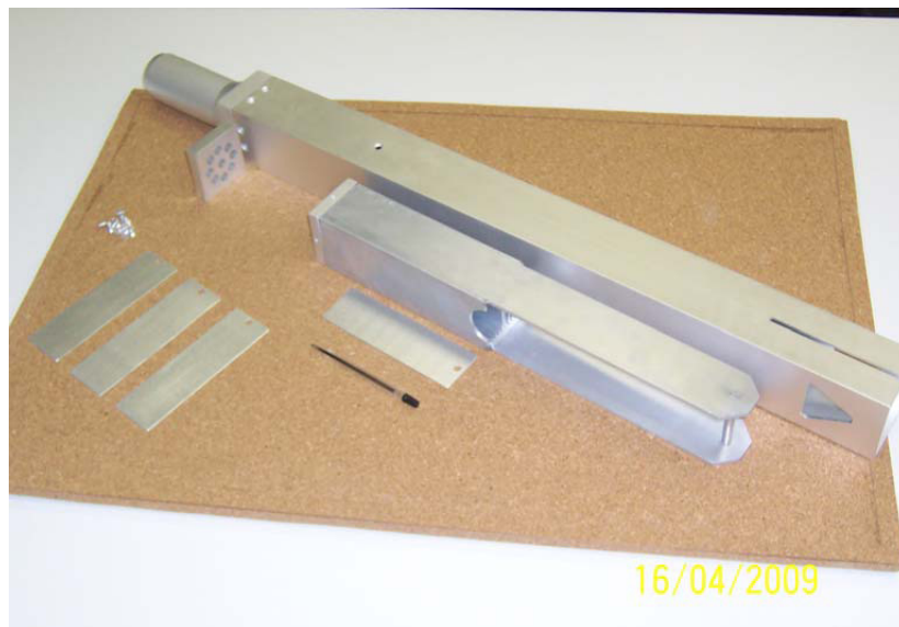
Fig 1: Miniplate Irradiation Device – MID.

A special Miniplate Irradiation Device (MID) was designed for irradiation of the fuel miniplates in the IEA-R1 reactor. Figure 1 shows the MID. The MID has the external dimensions of the IEA-R1 fuel element. The miniplates will be allocated in a box with indented bars placed inside the external part of the MID. Figure 2 shows the transversal section of the MID.