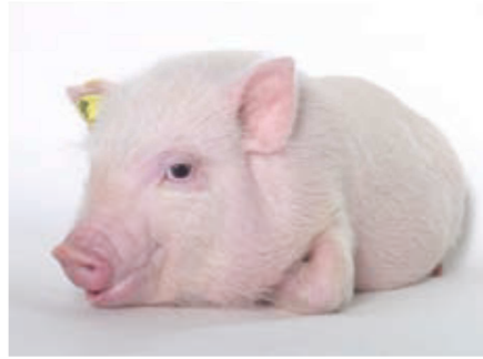
Figure 2: Example of minipig [2].