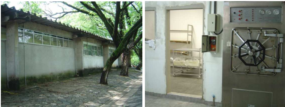
Figure 1: IPEN's Animal House Facilities and refurbished laboratory.

IPEN has a long tradition as supplier of quality animals for biomedical research. The project of the present Nuclear and Energy Research Institute (IPEN) Animal House Facilities was accomplished in the year of 1964. The facility was planned with the objective of being a production unit and a local for keeping of defined animals from sanitary, genetic and environmental point of view. The Animal House Facilities occupy an area of 840 m 2 , with one pavement, where the production areas and the stock of original animal models of the own Institution are distributed, as well as the maintenance of animals from other national or foreigner institutions. It supplies rats and mice for biological tests of radiopharmaceutical lots, produced in IPEN, before they be sent to hospitals and clinics spread out in Brazil, for use in Nuclear Medicine. It also supplies rats and mice for tests of materials for odontology, for tests with growth hormones and for researches of new pharmaceuticals and radiopharmaceuticals, among others applications. Recently, the laboratory has been fully refurbished. In the figure 1 it is presented pictures of the IPEN's Animal House Facilities and one of its refurbished laboratories.