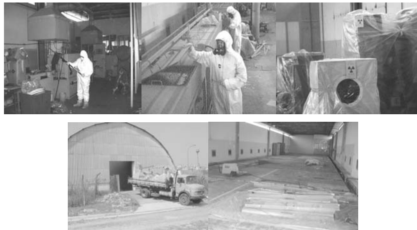
Figure. 2: In this picture there are, respectively, the monitoring, the disassembly, the packing and labeling of materials in the building 24, and finally the transportation and the installation of this planned operation .