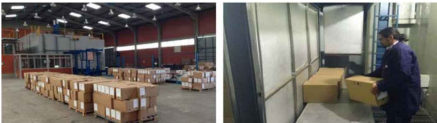
FIG. 15.3. Cia City historical documents at the Nuclear and Energy Research Institute.