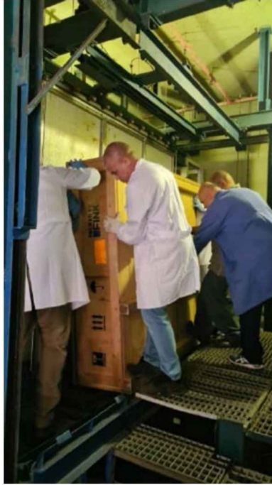
FIG. 15.5. Positioning the box inside the irradiation chamber was difficult owing to the weight of the object.

An Indigenous Peoples object that was affected by subterranean termites was treated by the Museum of Archaeology and Ethnology of the University of São Paulo in 2023. The object, a cylinder made from buriti palm leaves and stalks of the caeté palm tree, is typically made by men from the Indigenous Bororo people in the Mato Grosso state of Brazil and plays an important role in funerary rituals. Its width can exceed 2.80 m, and it is very dense and very heavy. For objects such as these, tailored transport arrangements are required so that they can be transported safely and in accordance with the museum's conservation protocols (Fig. 15.5).