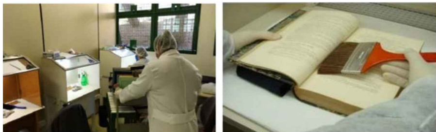
FIG. 15.4. Cleaning books after gamma radiation treatment.

Because of the low predictability of gas penetration and the need to maintain strict control over the process in order to ensure its effectiveness, treatments using large volumes of modified atmospheric gases may not be effective [15.16]. However, ionizing radiation can be an effective method for the disinfection of large objects.