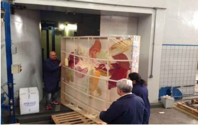
FIG. 15.6. Modern art radiation processing at the Nuclear and Energy Research Institute.

It is necessary to reposition dosimeters after intermediate readings to measure the final dose. Measurements are carried out using an ultraviolet–visible spectrophotometer at the end of the radiation processing to ensure that the recommended dose has been applied, taking into consideration the uncertainties in the measurement of between 2% and 2.5%.