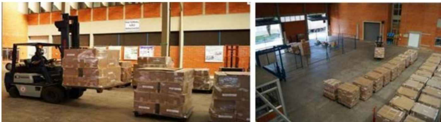
FIG. 15.1. Large scale irradiations of archived materials at the Multipurpose Gamma Irradiation Facility, Nuclear and Energy Research Institute.

More than 1000 m 3 of several book collections attacked by insects and fungi have been disinfected by irradiation at IPEN (Fig. 15.1).