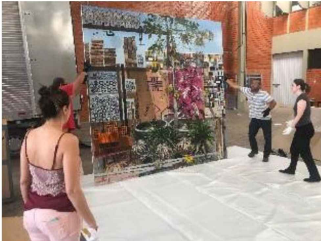
FIG. 15.8. To ensure that the oversized canvas is handled properly, conservators monitor the arrival of an artwork at the Nuclear and Energy Research Institute.

A selection of the historical and archaeological objects of the collection have been donated to public institutions, including museums of the University of São Paulo. Before these objects were transferred to the museums, they were treated at