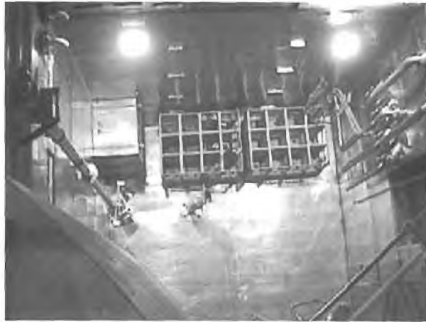
Figure 3: Storage Racks at RP-10