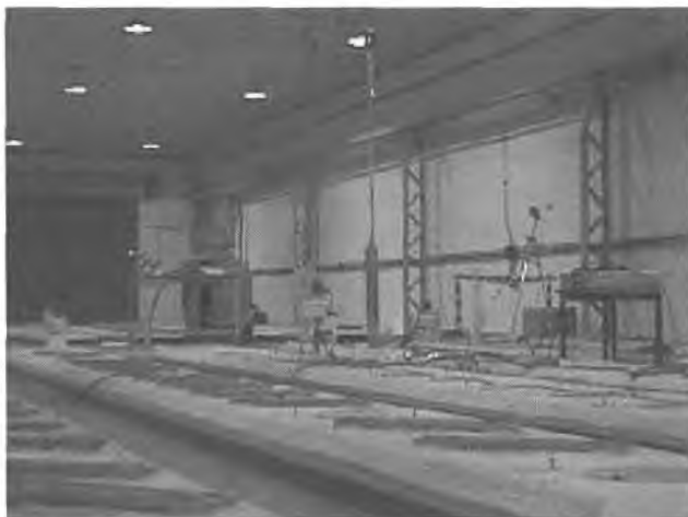
Figure 1: SFE Argentinean Central Storage Facility at Ezeiza Nuclear Center

However, given the aging of the facility, CNEA has presented a project to build a new wet facility located also at Ezeiza, in a pool located at the post irradiation facility, taking into account to utilize the infrastructure already existing at this building that will allow operational flexibility and integration with other operations of spent fuel management: inspection, conditioning, etc. This new interim wet storage facility is going to be designed to store all SFE from RR of Argentina. Finally, the Argentinean strategy for spent fuel management is a) Centralize the interim storage of RR spent Fuel, b) Complementary wet cooling of medium range, c) dry interim storage at long range, d) conditioning of the spent fuel for final disposal