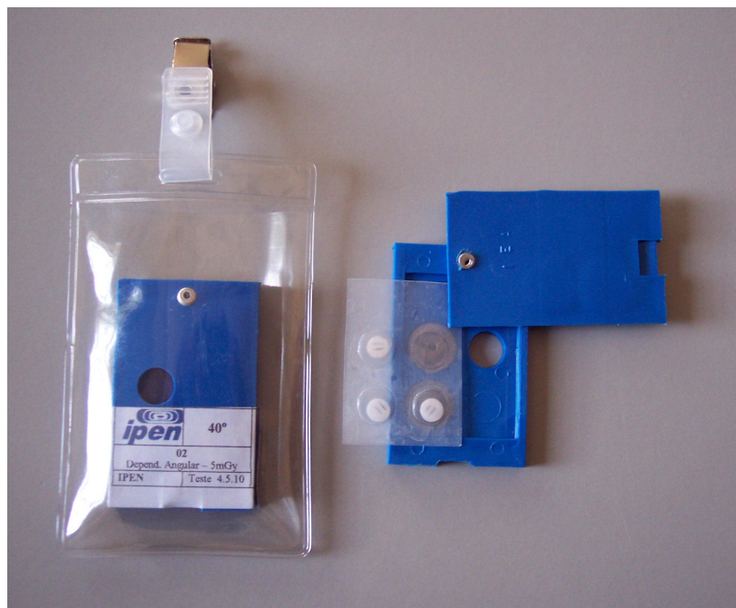
Figure 1: TLD opened used for environmental monitoring. It is shown the three phosphors, as small white discs inside the badge. Three TLDs are used in the Ref.Amb. point field.

It was used the same TL dosimeter (TLD) used in routine environmental monitoring for mines, industries or nuclear plants in Brazil, shown in Figure 1. This TLD is also used in personal dosimetry and is fully described in [3]. Its lower limit of measurement is 0,12 \mu\text{C/kg} [4], in photon exposure quantity.